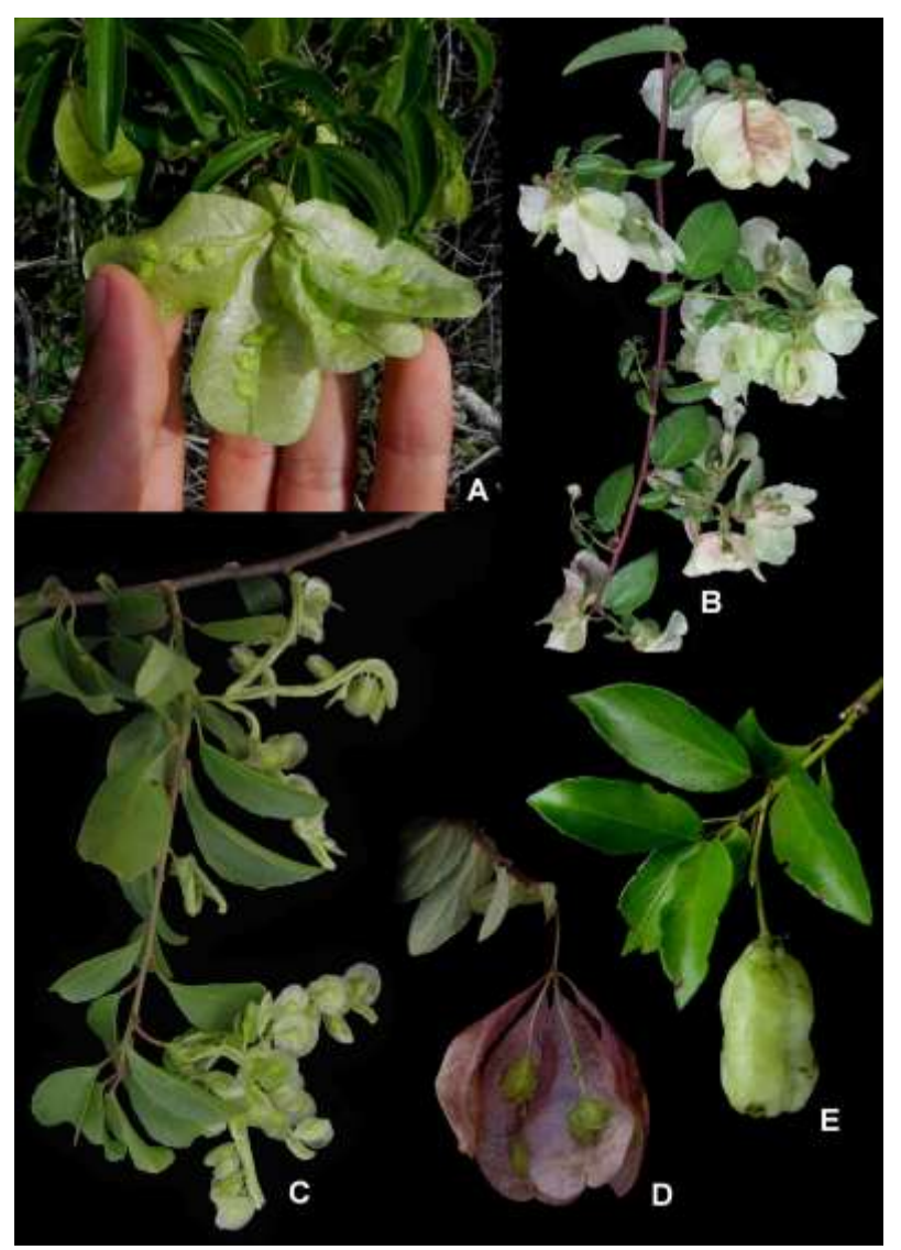
Figure 3. Diversity of fruits in Anchietea. A. A. selloviana. B. A. ballardii. C. A. pyrifolia. D. A. ferrucciae. E. A. exalata.

Twining lianas, scandent herbs, subshrubs or shrubs. Stems terete, reaching more than 20