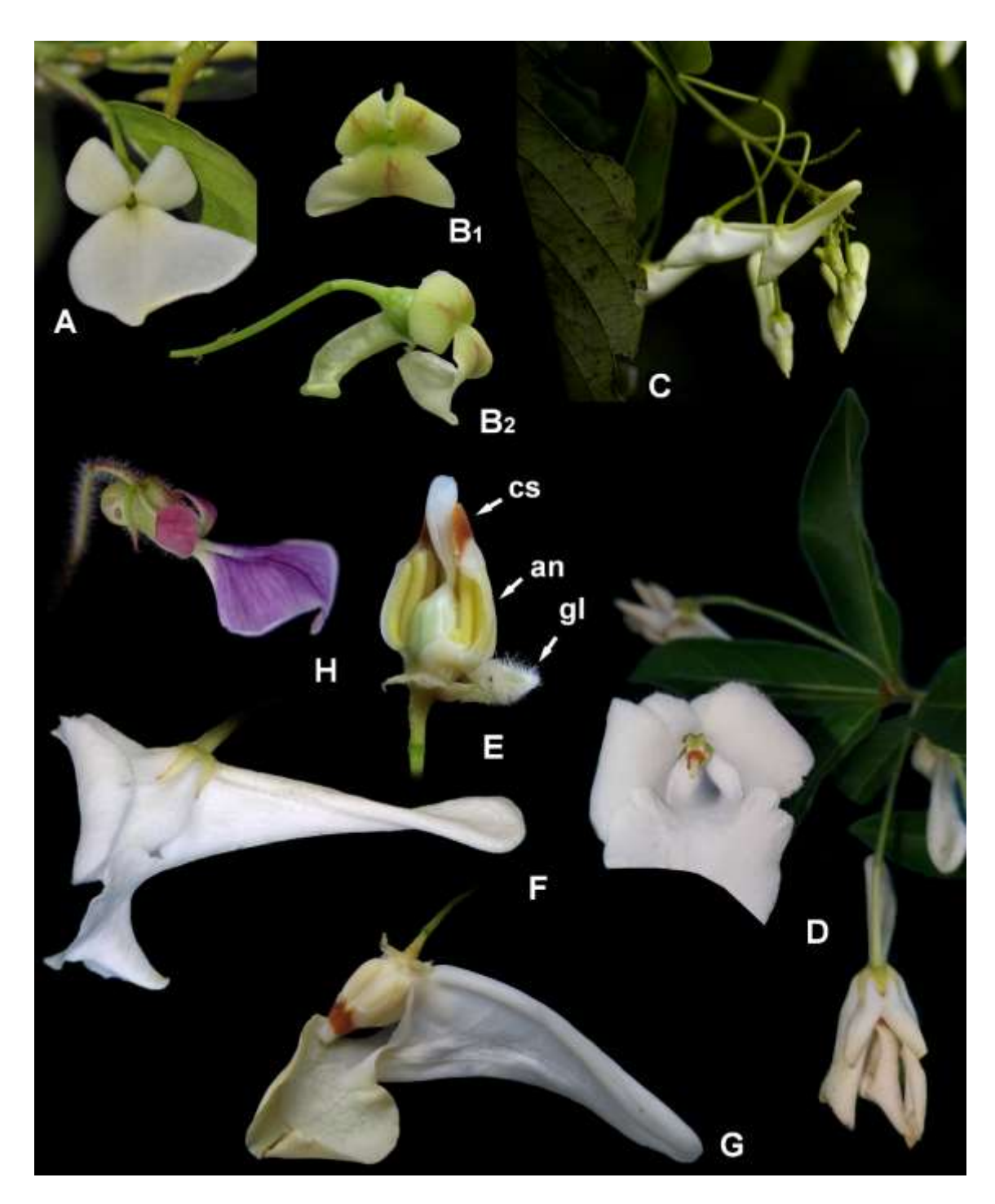
Figure 2. Floral diversity in lianescent Violaceae A. Anchietea pyrifolia . B. Anchietea exalata , frontal (B<sub>1</sub>) and lateral (B<sub>2</sub>) views C. Calyptrion arboreum , detail of inflorescence. D. Calyptrion cf. pubescens , flowering branch. E. C. arboreum , androecium with two stamens removed to expose the gynoecium (cs = connective scale; an = anther; gl = gland). F. C. cf. pubescens , flower in lateral view. G. C. arboreum , flower with posterior and lateral petals removed to expose the androecium and gynoecium. H. Hybanthopsis bahiensis .