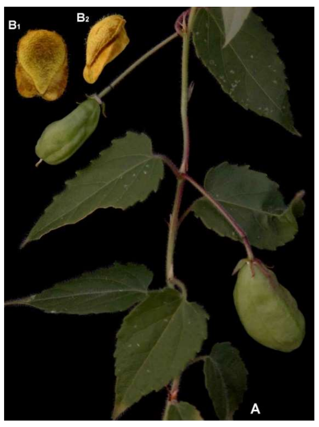
Figure 5. H. bahiensis. A. Habit. B. Seeds dorsal (B_1) and lateral (B_2) views.

Distribution : A Brazilian genus with a single species, H. bahiensis Paula-Souza, endemic to the Caatinga of Bahia and Sergipe, frequently found in disturbed places such as roadsides.