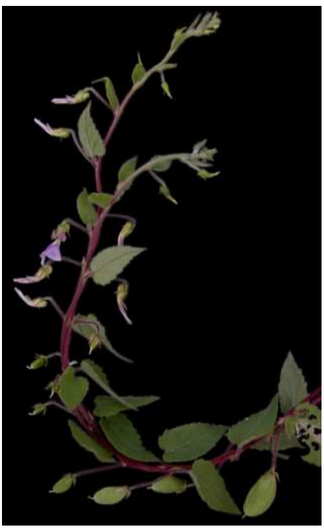
Hybanthopsis bahiensis Paula-Souza,)