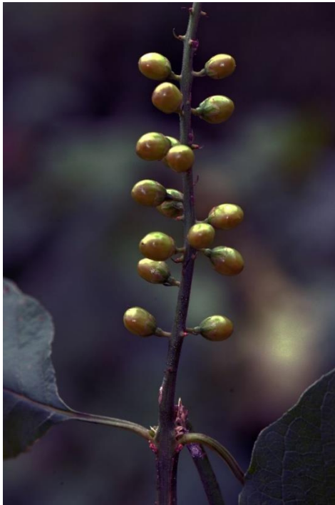
C. ovatifolium

CITHAREXYLUM Jussieu in Linnaeus, Sp. Pl. 625. 1753.