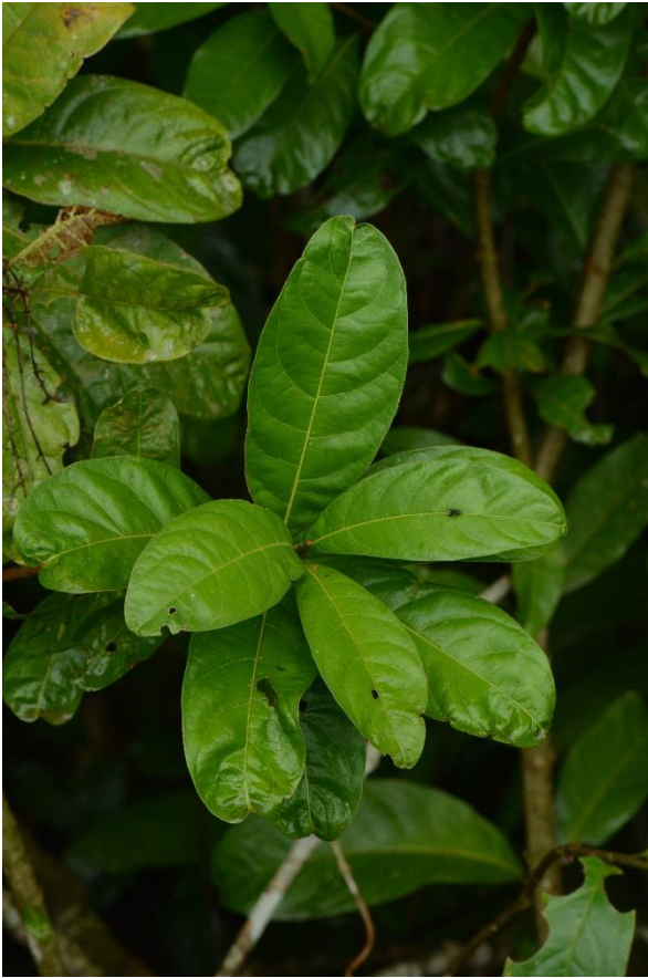
Petrea sp.

A pantropical family extending to warm temperate regions, of shrubs, trees, lianas and less often herbs, commonly aromatic; with 33 genera and about 910 species. Twining lianas are restricted to Petrea , while scrambling lianas or subshrubs are found in Citharexylum , Duranta , and Lantana . Verbenaceae are represented in the Neotropics by 24 genera and about 710 species, of which only 22 species are consistently reported as lianas or climbing plants, most of which belong to the genus Petrea .