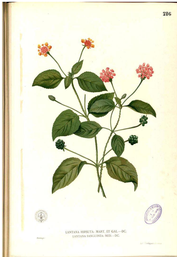
L. hirsuta

LANTANA Linnaeus, Sp. Pl. 626. 1753, (nom. cons.).