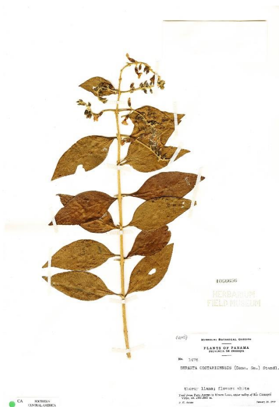
D. costaricensis

Erect, decumbent or rarely scrambling shrubs or small trees; vines with straight short axillary spines. Stems commonly obtusely quadrangular, sub-flattened at the nodes. Leaves non-aromatic, opposite, entire (in vine species), with pinnate venation; petioles long to short, glandless. Inflorescence of axillary racemes or distal frondobracteate panicles, with decussate or sub-opposite flowers along the axes; bracts minute, caducous. Calyx tubular to campanulate, conspicuously 5-costate, crowned by 5 minute teeth; corolla salverform, straight, bluish, lavender or white, 5-lobed; stamens 4, epipetalous, included; staminode 1; gynoecium with 4 fertile carpels, style slender, stigma bilobed. Fruit a drupe covered by an acrescent calyx; seeds commonly 2 per carpel.