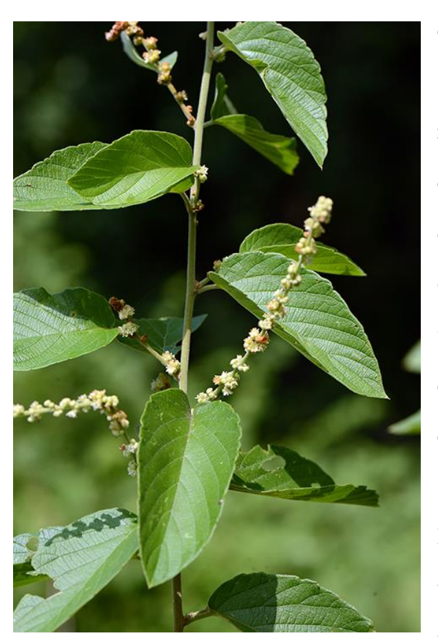
Gouania polygama, photo by P. Acevedo.

Tendrilled lianas; young stems cylindrical to angulate, smooth or striate; older stems