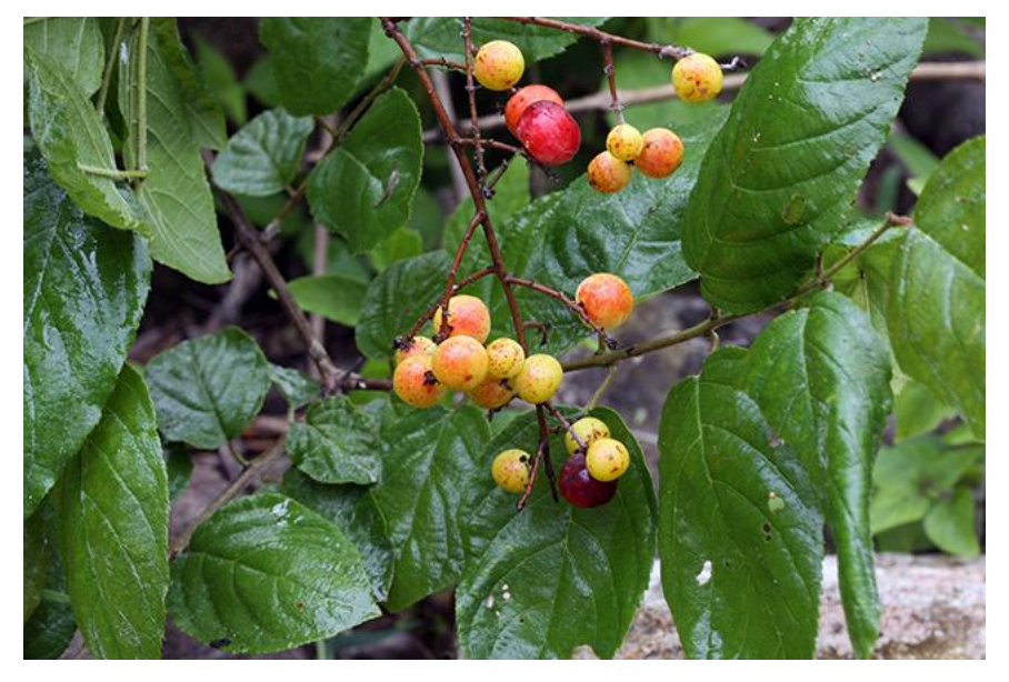
Sageretia elegans, photo by M.O. Montiel.

often with 3–5 strong secondary veins from base, the margins serrate; lower surface with prominent venation; petioles slender, short, 4–9 mm long. Inflorescences of axillary paniculate thyrses. Flowers sessile, ~1.5 cm long,