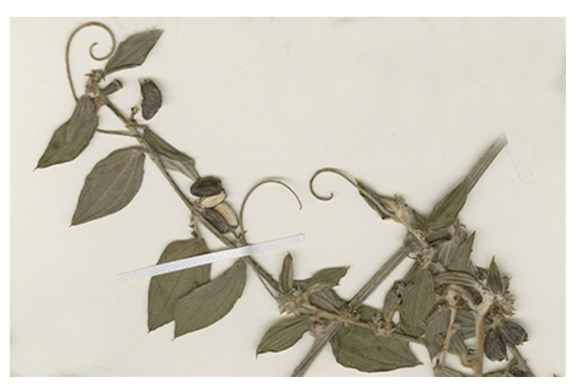
Johnstonalia axilliflora, from Smith & Vásquez 3396 (MO).

Tendrilled lianas; young stems angulate, 8-ribbed, appressed-pubescent. Tendrils simple, circinate, produced at the nodes of flowering branches. Leaves alternate, chartaceous, 3-nerved from base, with entire margins; petioles short, glandles; stipules linear, 4–5 mm long,