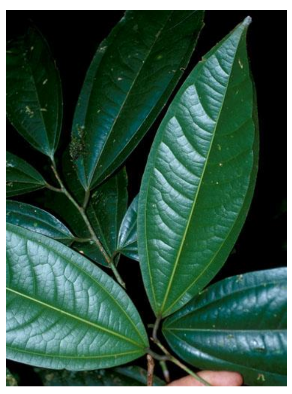
Ampelozizyphus amazonicus, photo by R. Foster.

Trees, erect or scrambling shrubs or lianas that reach up to 18 m in length; stems striate,