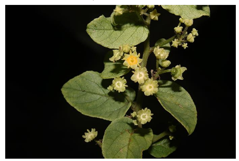
Reissekia smilacina, photo by D. Ferreira.

Tendrilled lianas. Young stems striate; older stems cylindrical, reaching 12 m in length, ~3 cm in diam.; cross section with slightly conspicuous rays and wide vessels; bark light brown and moderately rough forming rectangular plates (fig; 1e).