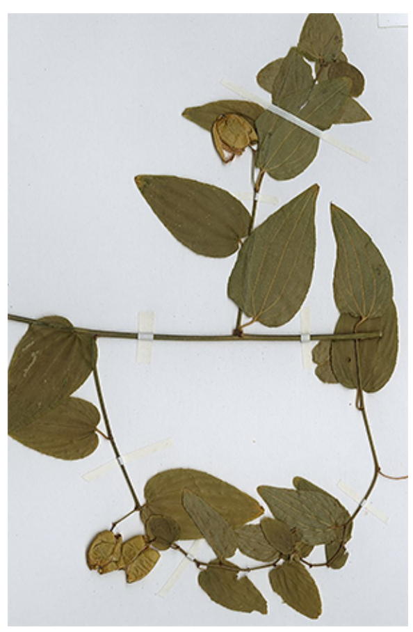
Alvimiantha tricamerata

Tendrilled lianas. Young stems 5-costate; stems few m long. Tendrils simple, circinate,