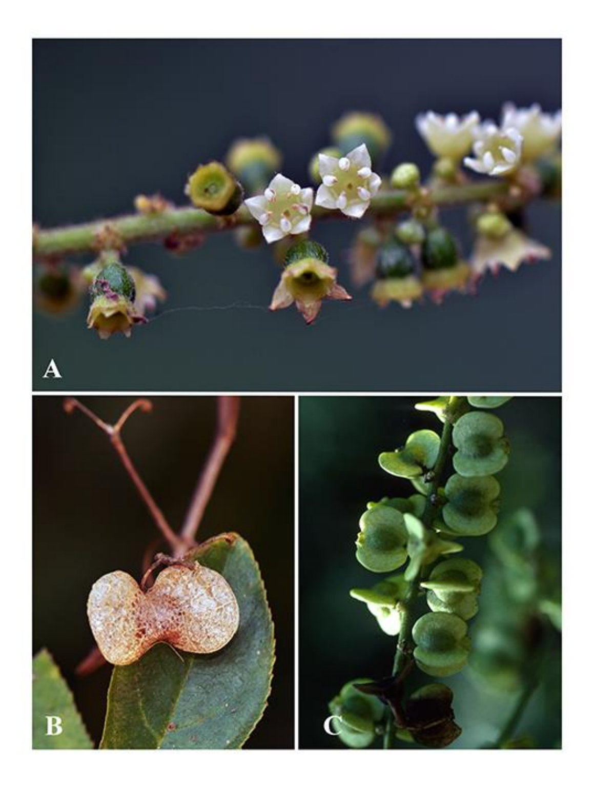
Figure 215 . A . Gouania sp. flowers with green hypanthium and white perianth. B . Reissekia sp. mericarps membranaceous, slightly inflated. C . Gouania lupuloides . mericarps subwoody.