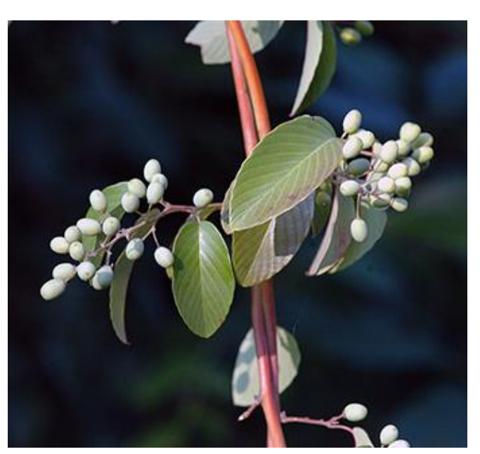
Berchemia scandens, photo by Larry Allain.

Erect shrubs or twining lianas; stems cylindrical; reaching 7–10 m in length and ~5 cm in