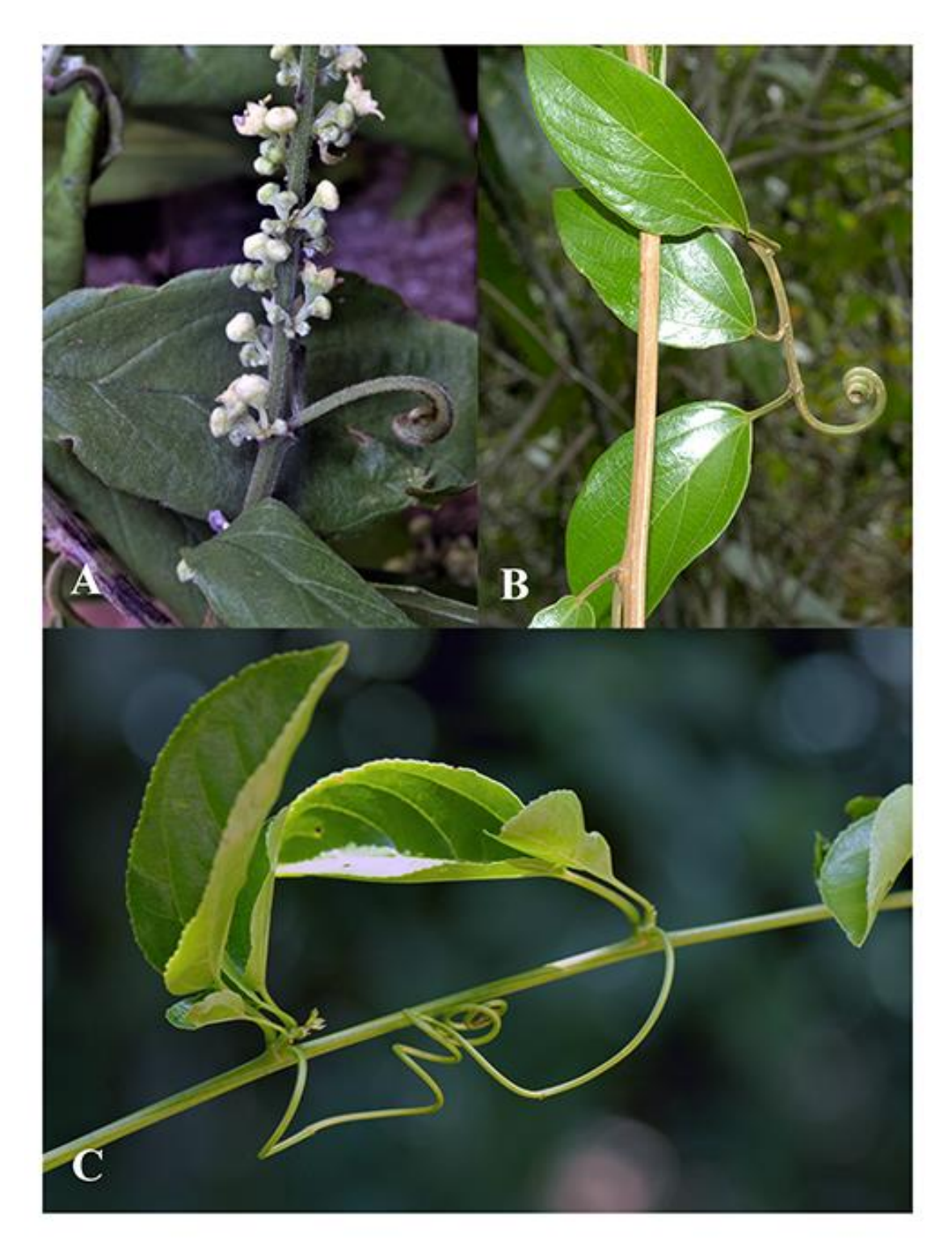
Figure 214 . A . Tendrils in Rhamnaceae. Gouania sp., tendril part of the inflorescence. B . Gouania sp. tendril distal on short lateral branches. C . Reissekia sp. tendrils precociously born on young axillary shoots.