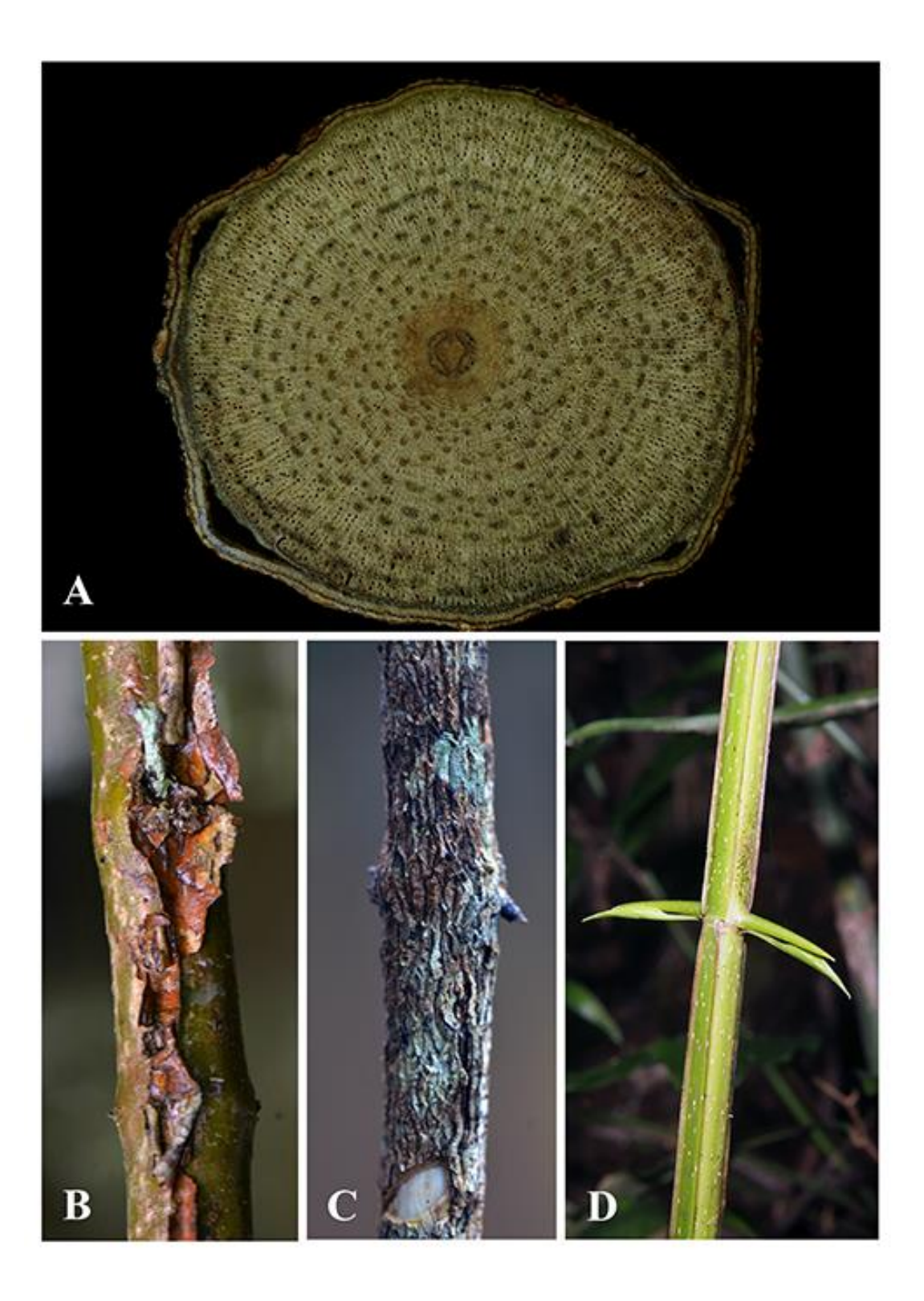
Figure 130 . Stems in Strychnos . A. Cross section of S. guianensis showing scattered interxylary islands of phloem. B. Papery flaky bark of Strychnos sp. C. Rough bark of Strychnos sp. D. Young shoot with quadrangular stems and axillary, opposite thorns of Strychnos sp.