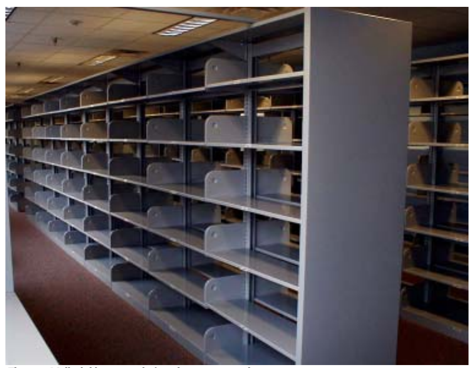
The new Mollusk library just before the move started.

All-in-all, the move was well worth the time and effort. There is no question that everyone benefits from having all of the departmental staff in contiguous space, but the biggest "winners" were the mollusk collections and library. Even though it will be several more years before we are finished with all of the move-related curation activities, at long last these valuable resources are housed in appropriate storage equipment, in spacious and hospitable storage areas readily accessible to staff and visitors alike.