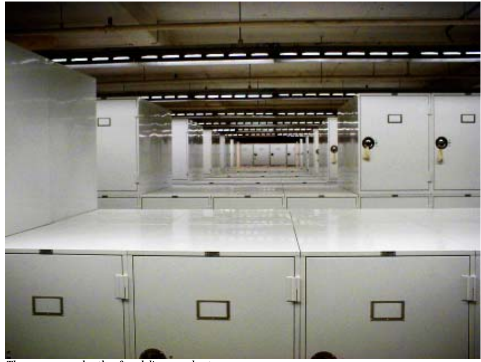
The new cases shortly after delivery and setup.

The most physically demanding parts of the collection moves are completed, and our collections were once again opened to visitors as of early April. Our wet collection is now stored in a clean, brightly lit, spacious room with aisles that are wide enough to accommodate a specimen cart. During the move we were able to decompress parts of the collection and to resolve several serious organization problems that were the result of extreme overcrowding. There are still a few things to do such as finish labeling the tiers and shelves and some minor cleanup, but the collection is accessible and specimens can easily be found.