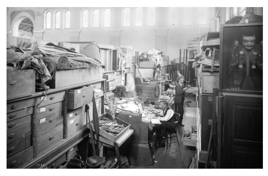
Workroom for Indian Ethnology, A&I Building, ca. 1890s. Image 3680 or NHB-3680, Smithsonian Institution Archives, Record Unit 95, Box 32, Folder: 19

The arrival of Spencer F. Baird as assistant secretary in 1850 initiated the Smithsonian's large scale, systematic collection of anthropological and other natural history specimens. In 1858, the Institution accepted the government collections previously displayed in the Great Hall of the Patent Office, which included objects gathered by the United States Exploring Expedition, Matthew Perry's voyages to Japan, and diplomatic gifts to American presidents from foreign dignitaries, including the King of Siam and the Sultan of Muscat. In 1876, Baird oversaw exhibits for the Centennial Exposition in Philadelphia, and afterward, convinced exhibitors to donate the art and artifacts, filling several boxcars. In 1879, the George Catlin collection, including four hundred and fifty of his paintings and numerous Native American artifacts, was bequeathed to the Smithsonian. The collections were growing so quickly that a formal Section of Ethnology was established, with curators hired to care for ethnological and archaeological collections.