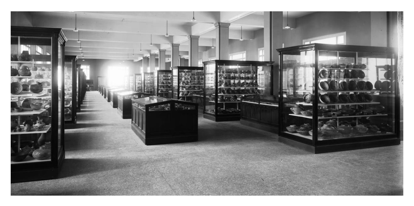
Anthropology Hall, United States National Museum, ca. 1911.