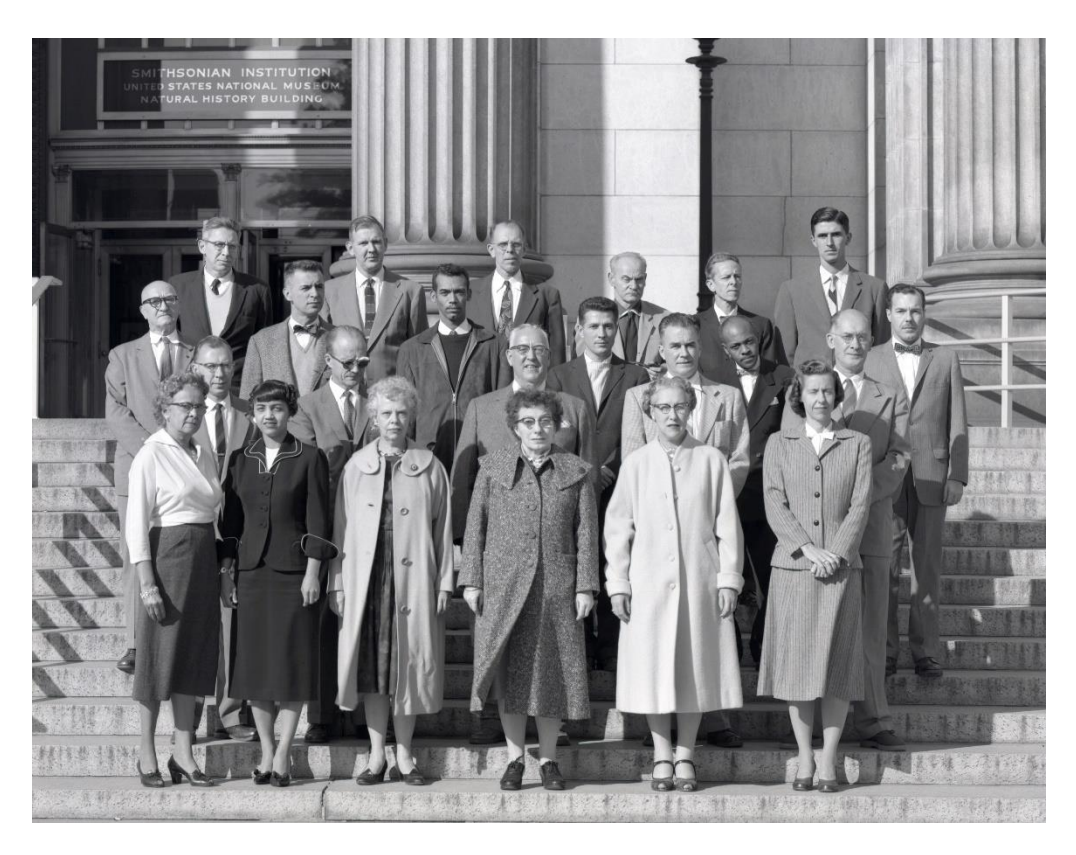
Department of Anthropology Staff, 1959. Smithsonian Institution Archives, Acc. 16-126, Box 01, Image No. MNH-136

In 1975, Congress authorized the addition of the National Anthropological Film Center (now the Human Studies Film Archives) to the Smithsonian, and in 1981, it became part of the Department of Anthropology.