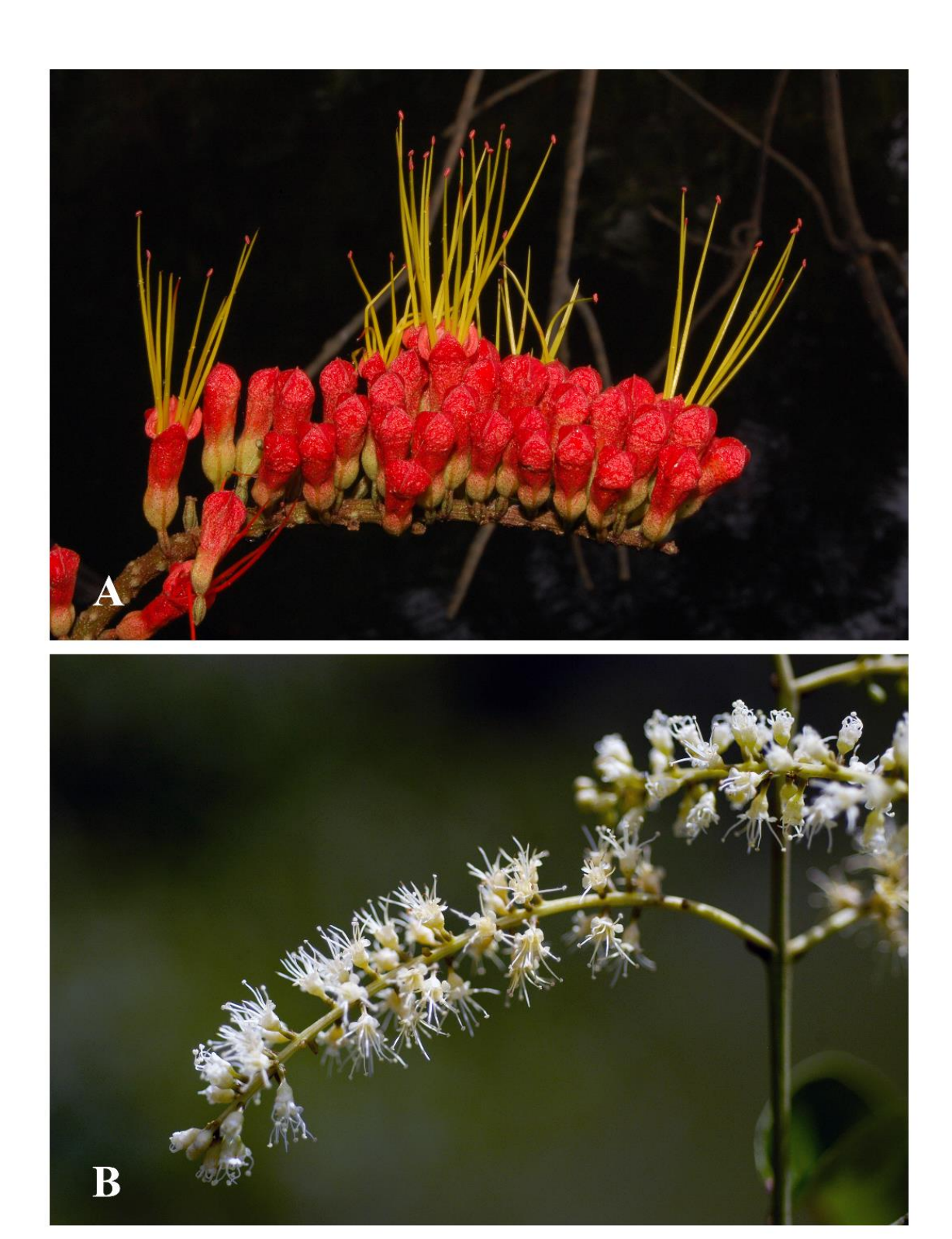
Figure 3 . Inflorescences and flowers in Combretum . A . C. rotundifolium , secund raceme, calyx and petals redorange, stamens filaments yellow. B . C. laxum , panicle branch, with white flowers.