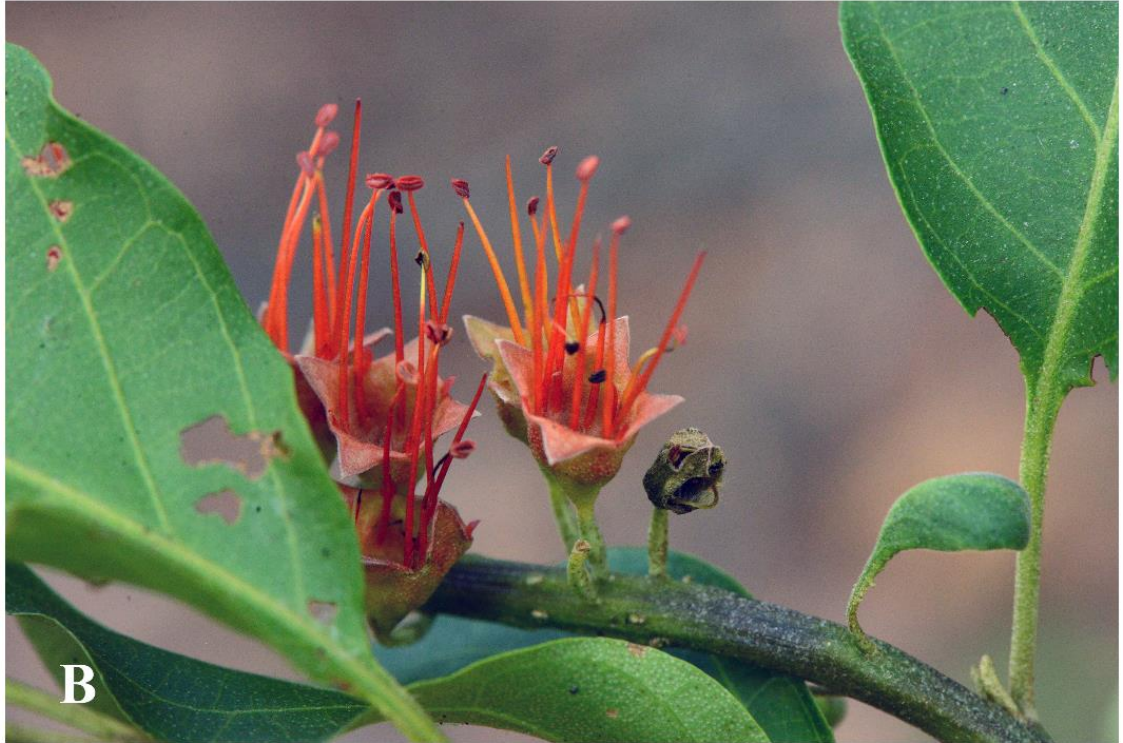
Figure 4 . Inflorescences and flowers in Combretum . A . C . indicum distal raceme; hypanthium green, sepals rosy, style exserted. B . C . farinosum , secund raceme, flowers apetalous, calyx and stamens orange.