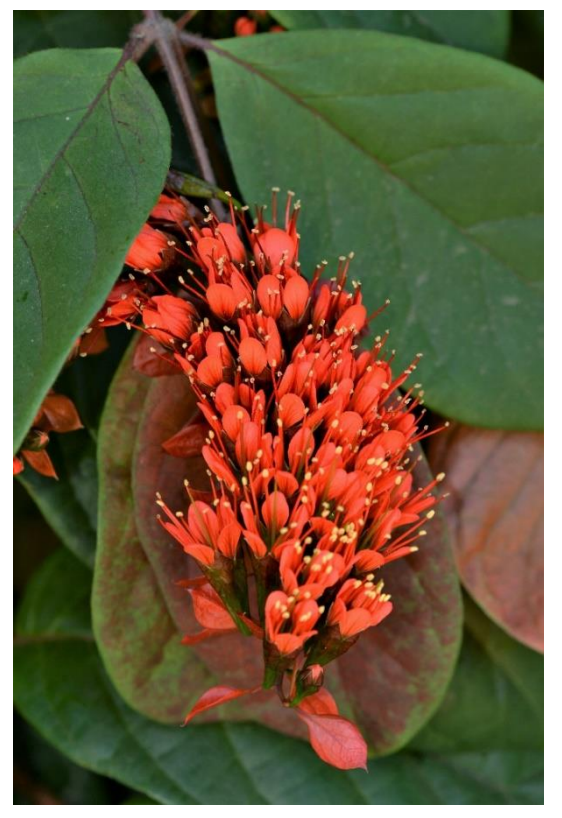
Combretum grandiflorum

A family of trees, shrubs and lianas with pantropical distribution, some members extending to warm temperate zones. Worldwide, the family consists of 11 genera and about 400 species, of which only Combretum , Getonia and Meiostemon contain lianas. In the Neotropics, the family is represented by 4 genera and about 85 species, of which only Combretum has 33 species of climbing plants. The genus is generally found at between 200-800 m elevation and occurs in wet or gallery forests.