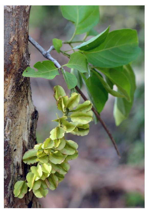
C. farinosum