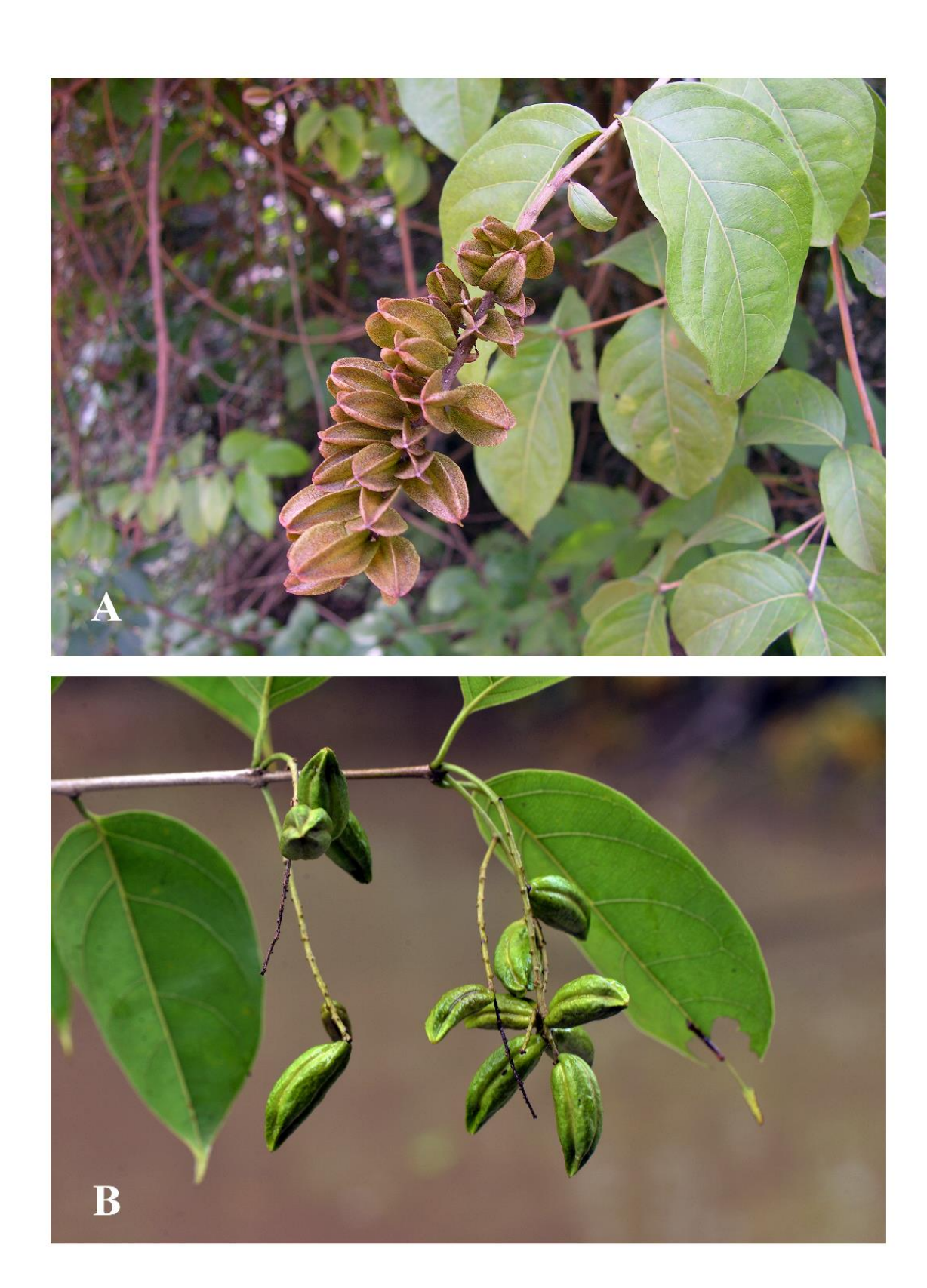
Figure 5 . Fruits in Combretum . A . C . 4-winged samaras. B . Combretum sp., 4-ribbed fruits.