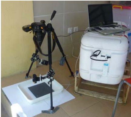
Plate photo set-up

Schematic of the grid used to standardize the photos. The photos can also be taken without this system but make sure they overlap and are taken on the same plane