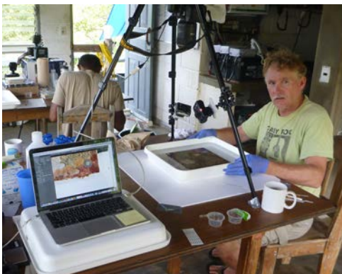
Camera connected to the computer