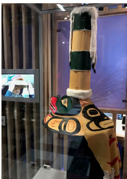
Replica of Kiks.ádi clan sculpin hat on display in Smithsonian FUTURES exhibit.

In 2021 an exhibition called FUTURES opened at the Smithsonian's newly renovated Arts and Industries Building, marking the 175th anniversary of the institution. The exhibit combined science, art, technology, and history to explore many possible futures. One featured object was an exact replica of a Tlingit ceremonial crest hat that was made by the Smithsonian using 3D technology to aid in cultural restoration and revitalization.