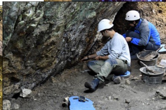
Excavation in Portalon, Spain