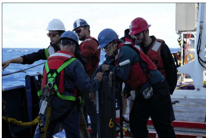
Securing heavy equipment during the Fall 2018 GEOTRACES cruise.

Currently, I am the co-president and K-12 Education Coordinator for the WHOI-based Broader Impacts Group, where I spend a lot of time with young scientists-in-the-making. I also spent 3 weeks earlier this year travelling across New Zealand with my wonderful partner, where the geologist in me had an absolute blast.