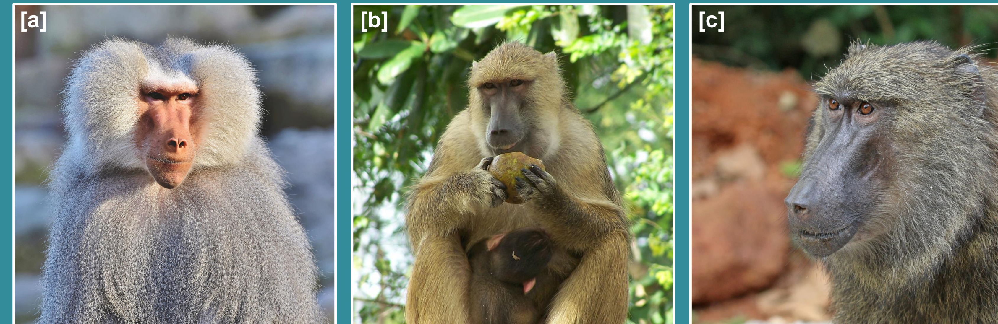
Figure 2. Exposed skin pigmentation in Papio : [a] P. hamadryas representing the light-skinned pigmentation category; [b] P. cynocephalus representing the medium-skinned pigmentation category; [c] P. anubis representing the dark-skinned pigmentation category.