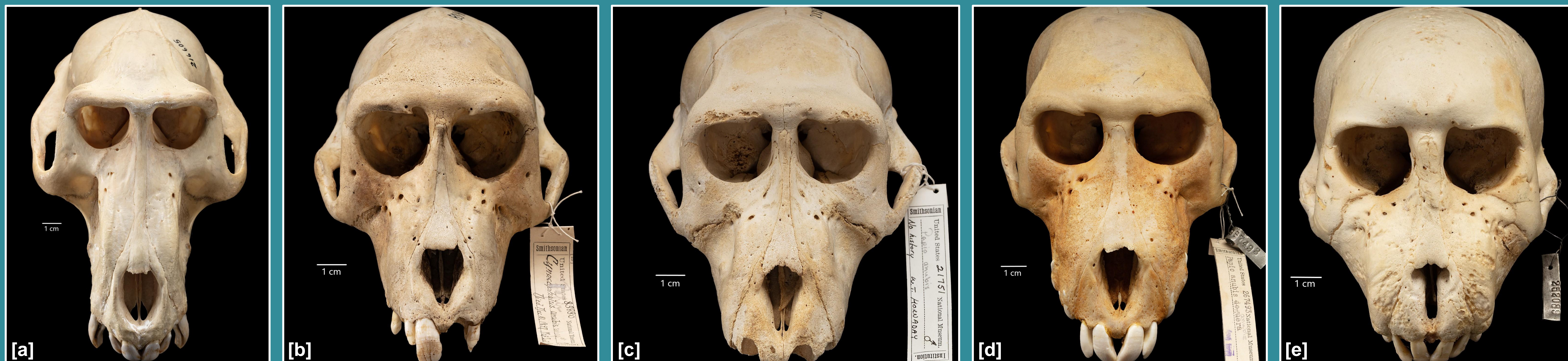
Figure 1. Differential severity of MBD as represented by maxillary thickening in Papio specimens: [a] non-pathological specimen with no evidence of MBD; [b-e] pathological specimens with evidence of MBD.

Presence or absence of maxillary thickening and inflammation was the primary indicator for MBD related to vitamin D deficiency (Fig. 1). 2 Exposed skin color for the subspecies was categorized into “light”, “medium”, and “dark” following Ziegler et al. (2018), including: P. anubis and P. papio (“dark”), P. ursinus and P. cynocephalus (“medium”), and P. hamadryas (“light”) (Fig. 2).